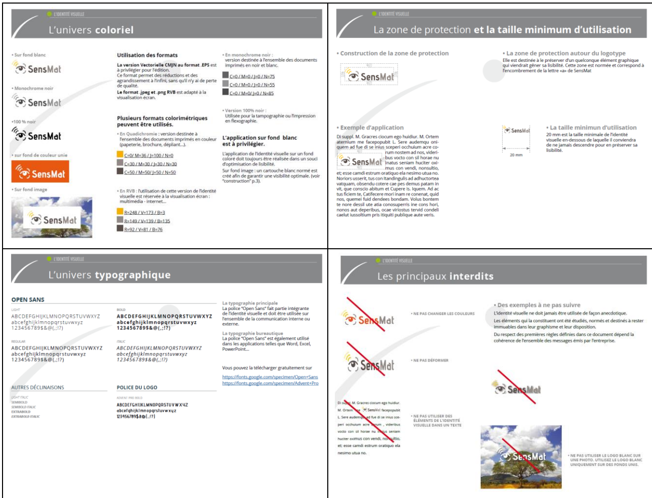
Figure 2: SensMat Graphical identity